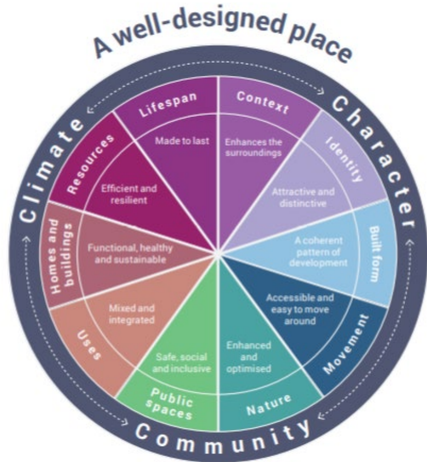
10 Characteristics of Well Designed Places (National Design Guide Extract)