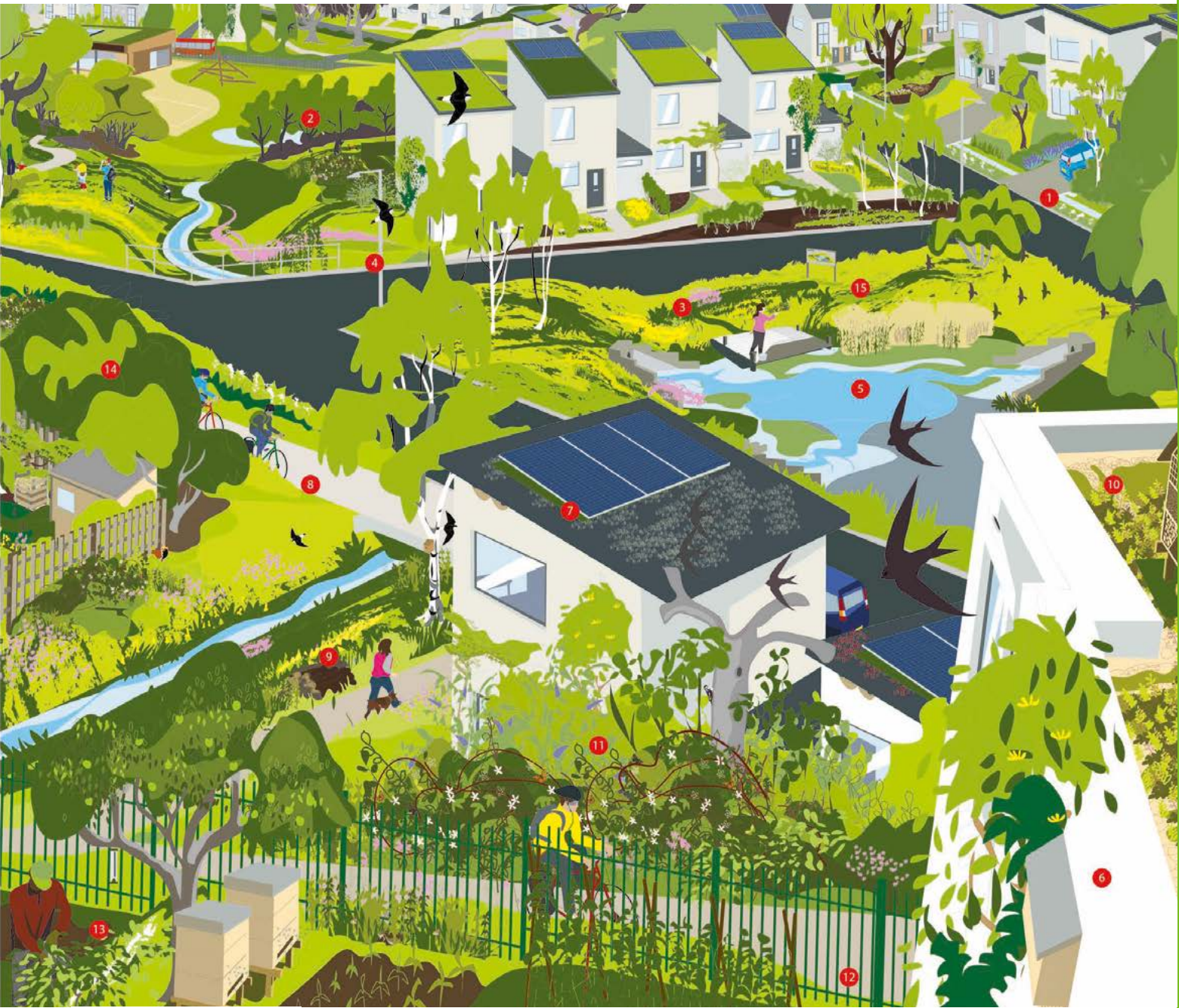
Illustration: Homes for Wildlife and People – How to build houses in a nature friendly way: A Wildlife Trusts Publication (11th January 2018)