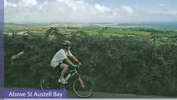
Above St Austell Bay