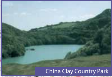
China Clay Country Park

Eden Project. Cornwall's largest Millennium project, the Eden Project has reclaimed and transformed a fifteen hectare (34 acre) china clay pit creating two climate-controlled plant biomes. They recreate the climate of the humid tropics and warm temperate regions, enabling plants to grow to a similar height and diversity as in their country of origin.