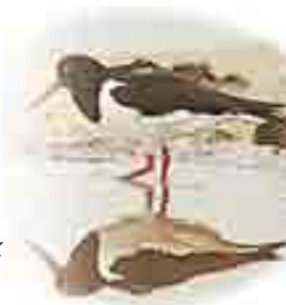
Oyster Catcher, Hayle Estuary